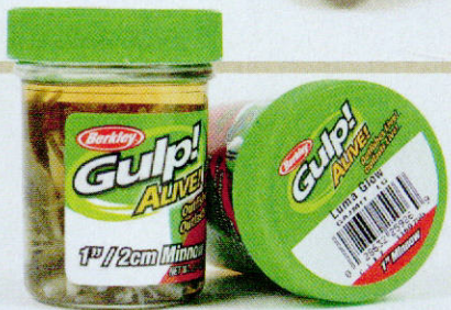
Gulp Alive Berkley