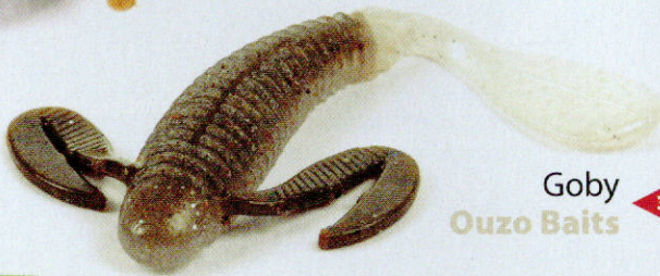
Goby Ouzo Baits