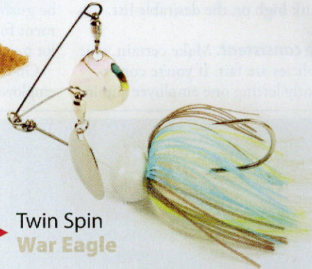
Twin Spin War Eagle